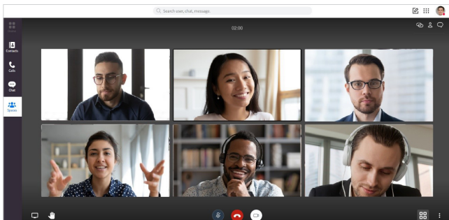
[ Video conference ]